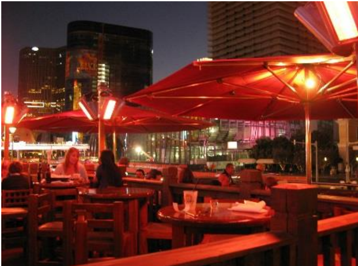
Typical use for Infresco S 6kW

Any application where high in-rush current is an issue or control is required. Typical uses are infrared heating lamps e.g. garden lighting.